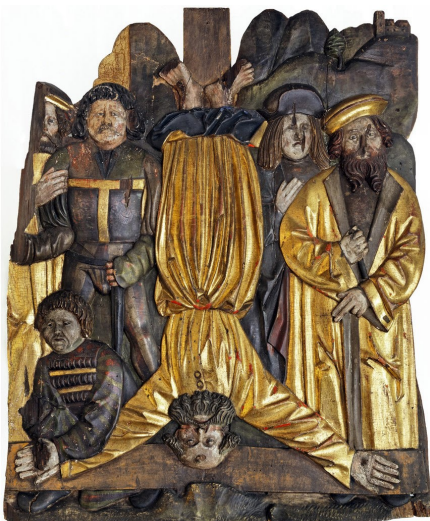
Martyrdom of Peter, Unknown artist

Symbols can evolve and take on new meanings over time, so it is important to approach them with an understanding of their historical and cultural context. For example, the Swastika comes from a Sanskrit word meaning "conducive to well-being," and has been widely respected by Buddhists, Hindus and Jains for thousands of years. After Adolph Hitler appropriated the Swastika as an emblem of his Nazi party, it became associated with hatred and evil.